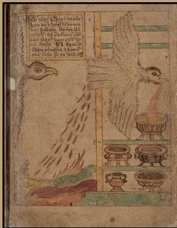
Reykjavík, Árnastofnun, SÁM 66 (s.xviii 3/4 ), fol.76r.

Thank you for your attendance and participation in this year's conference. We hope you enjoyed it and look forward to seeing you all again next year, if not sooner!